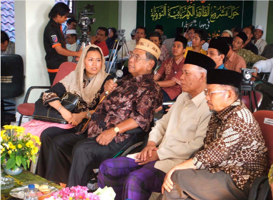
Former President Abdurrahman Wahin at the opening ceremony of the clerics' meeting, September 2007

works that had emerged in 2007 were also strengthened by the establishment of Jaringan Alam Lestari Muria (Network for Sustainable Muria, Jalamuria) in December 2008. Functioning as an umbrella organization for more than 50 anti-nuclear groups in three districts around the Muria Peninsula, Jalamuria continues to bolster the resistance movement and bring it to national-level decision-makers. 54