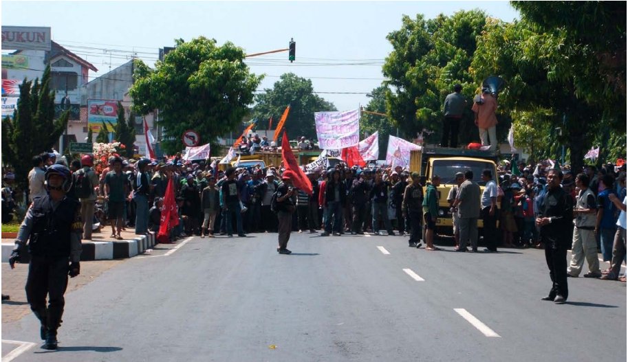
Mass protest in Jepara, September 2007

June 2007, several massive protests comprised of thousands of participants erupted not only in Balong village and Jepara's capital, but also in neighbouring Kudus and Pati. 46 En masse, people gave voice to public distrust of the nuclear power agenda as well as the geological, technological, environmental and institutional soundness supposedly underlying it (Amir 2010b, p. 128). 47 A program organized by Technology Ministry, which would use funds from the nuclear socialization budget to send pro-nuclear Commission VII mem-