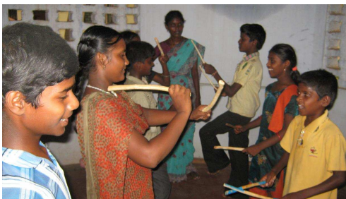
Children learn 'kolattam'