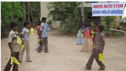
Children learn 'oyilattam'