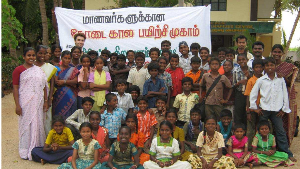
School of children participated in the summer camp