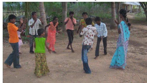
Children learn street theatre techniques