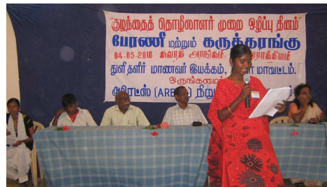
Children perform cultural programmes

The following resolutions were passed at the end of the seminar: