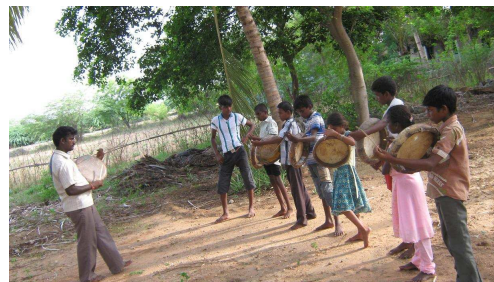
Children learn 'paraiyattam'