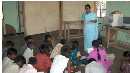
Basics of computer is taught