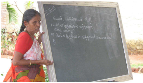
Basics of Tamil is taught