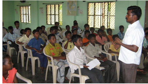
The camp starts